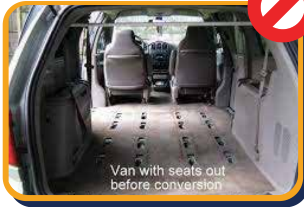
SEATS REMOVED UNACCEPTABLE