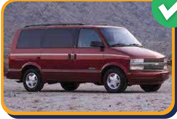
ECOLINE VANS WITH SEATS AND WINDOWS IS ACCEPTABLE