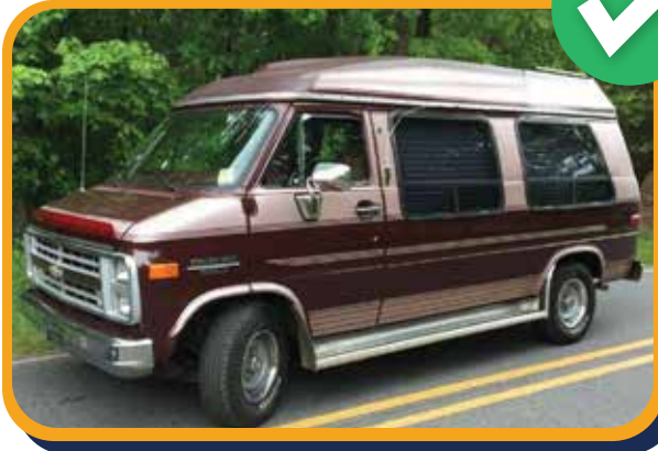
CONVERSION VANS ARE ACCEPTABLE WITH SEATS AND WINDOWS.