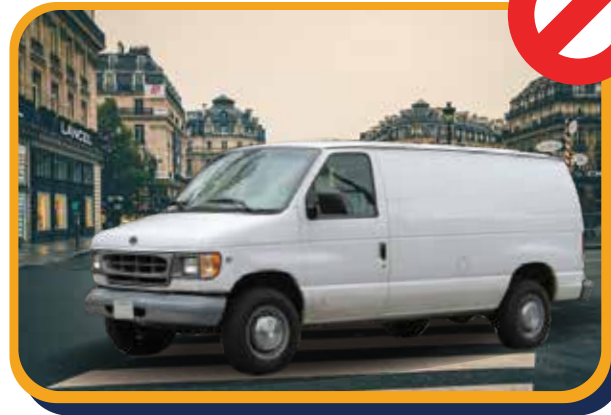
WINDOWLESS VANS UNACCEPTABLE