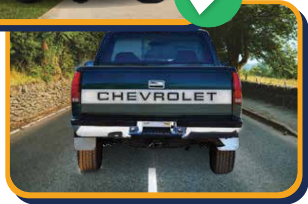
1 TON WITH ONLY 4 WHEELS IS ACCEPTABLE